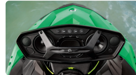
BRP Audio - portable system (optional) High-quality waterproof 50-watt Bluetooth® portable sound system.