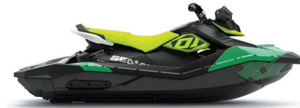
SPARK® TRIXX™ 3UP with sound system

BRP limited warranty covers the watercraft for one year.