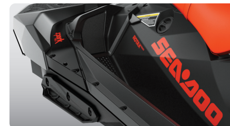
Step wedges Provides enhanced stability and confidence in different riding positions, making it easier to pull off tricks like a pro.