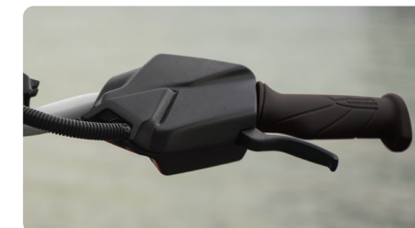
iBR® (Intelligent Brake & Reverse) Exclusive to Sea-Doo®, iBR® stops the watercraft sooner and provides more control and maneuverability at low speeds and in reverse.