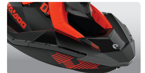
Exclusive color and graphics Exclusive Trixx™ bold color and graphics