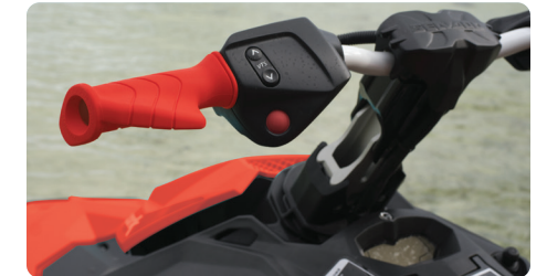
Extended Range VTS™ (Variable Trim System) Offers double the range of the regular VTS™ for easier and more exaggerated tricks.