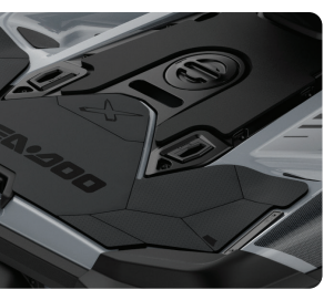
Swim platform with integrated LinQ<sup>™</sup> attachments points An innovative hull that sets the benchmark for rough water handling, stability,