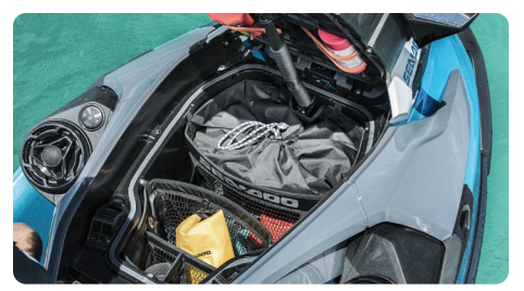
Direct-access front storage Large front storage area that's easily accessible from a seated position.<sup>1</sup>