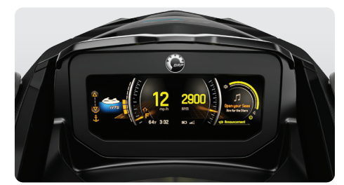
NEW full-color panoramic 7.8" LCD display Full-color display with incredible visibility and a new level of funcitonality. Bluetooth capability and app integration with BRP Connect provide music, weather, navigation and more.