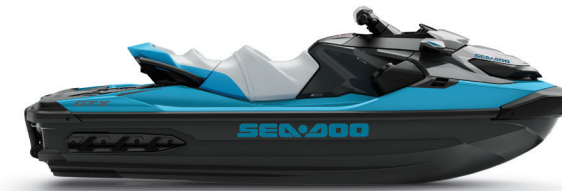
Beach Blue Metallic & Lava Gray (GTX 170 only)