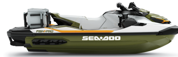
White & Night Green